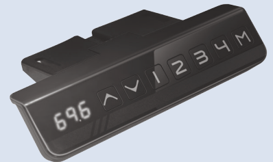
Optional Programmable Switch 4 programmable positions with LED readout of desk height.