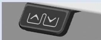
Supplied Control Switch