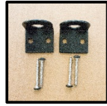
Contemporary Guide Brackets (6096 Drop Rods)